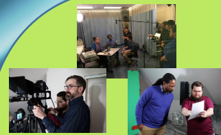
Produced a Training Video to Teach Hearing Researchers How to Work with Deaf Participants