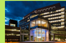
Test Training Video in UMMS iCELS Simulation Center (Spring 2018)