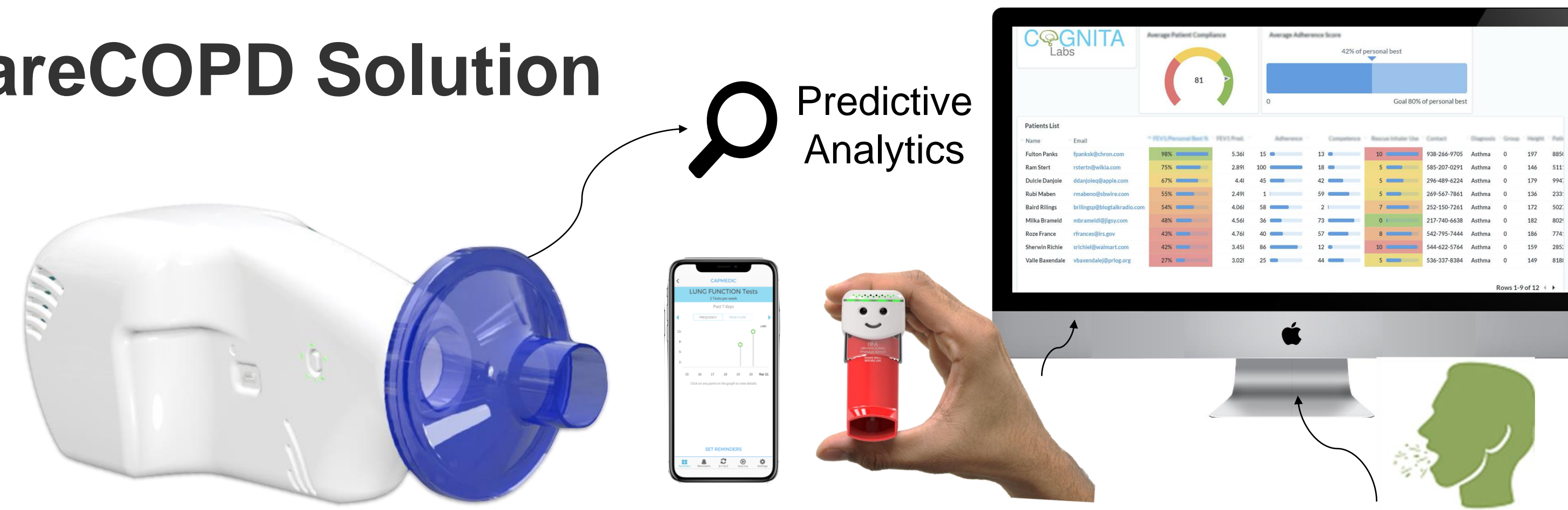
PulmoScan measures Oscillometry Lung Function