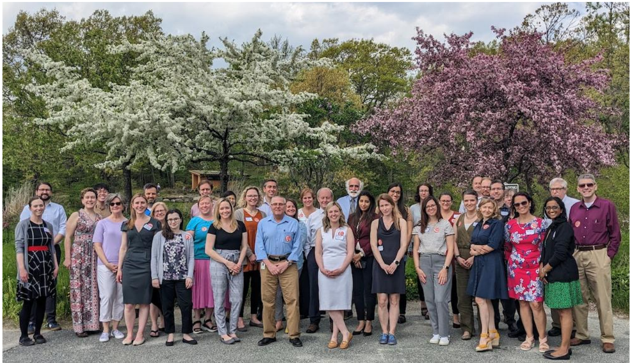
The annual faculty retreat took place at Tower Hill Botanical Gardens on May 11th

The UMass Chan Medical School Department of Psychiatry training office has a few announcements this spring 2023.